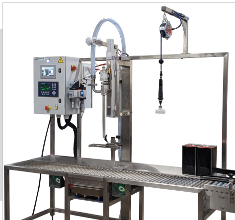
Diving weight table