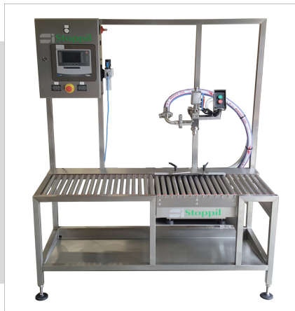
Weight table with rollers