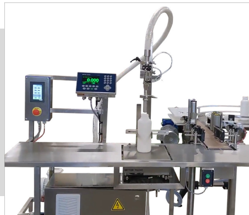
Weight table with feeding table